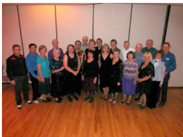
Current board & future board!